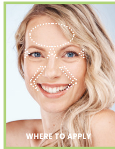
WHERE TO APPLY