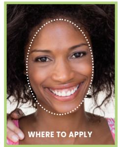
WHERE TO APPLY