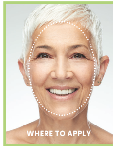
WHERE TO APPLY