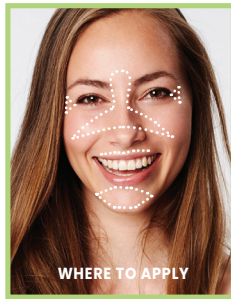
WHERE TO APPLY