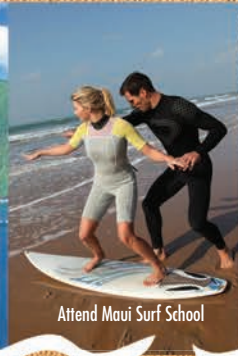
Attend Maui Surf School