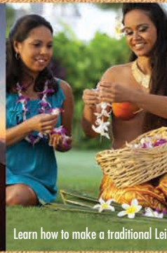
Learn how to make a traditional Lei