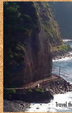
Travel the road to Hana