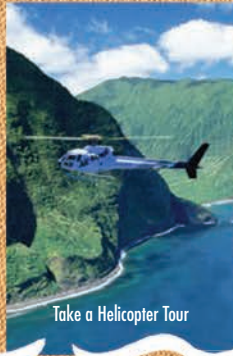
Take a Helicopter Tour