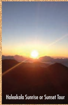
Haleakala Sunrise or Sunset Tour