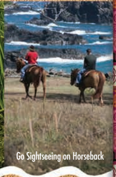
Go Sightseeing on Horseback