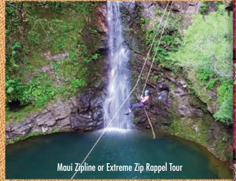
Maui Zipline or Extreme Zip Rappel Tour