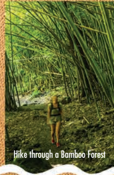
Hike through a Bamboo Forest