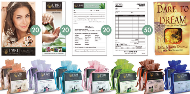
Business Supply BONUS Set includes: 20 Catalogs, 20 L'BRI vs. Competition Brochures, 20 Beauty Profile forms, 50 Customer Receipt forms, 1 Dare to Dream book, and 2 each of 7 different Sample Sets.

2 When you submit 6 qualified* Shows in your first 45 days, you'll receive a Business Supply BONUS Set valued at $82.90 to keep you stocked up and ready for more Shows and new customers.