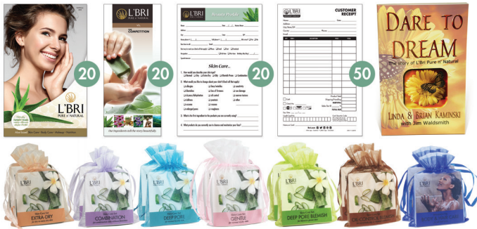
Business Supply BONUS Set includes: 20 Catalogs, 20 L'BRI vs. Competition Brochures, 20 Beauty Profile forms, 50 Customer Receipt forms, 1 Dare to Dream book, and 2 each of 7 different Sample Sets.

2 When you submit 6 qualified* Shows in your first 45 days, you'll receive a Business Supply BONUS Set valued at $129.90 to keep you stocked up and ready for more Shows and new customers.