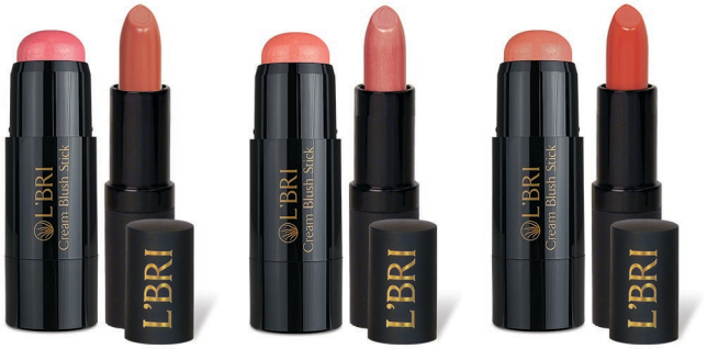
Peony Cream Blush with Desert Rose Lipstick AV22-5000

Anniversary savings of 13–25% on selected makeup favorites!